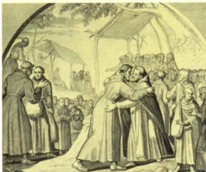
289. The General Chapter

exercises supreme authority in the life of the Community. As a sign of unity in charity it is to (cf. Can. 631§1):